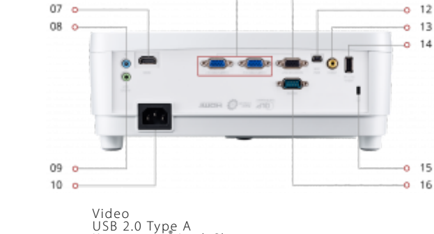
Video USB 2.0 Type A Kensington Lock Slot RS232